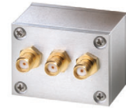
CASE STYLE: M21