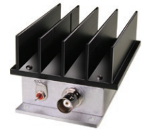
BNC version shown