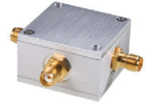
SMA version shown CASE STYLE: K18