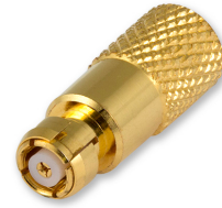
CASE STYLE: LL2145