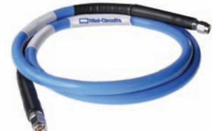
CASE STYLE: MB1629-4