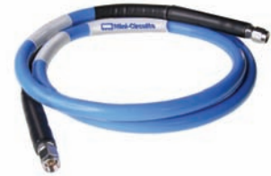
CASE STYLE: MA1628-6.56