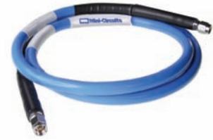
CASE STYLE: MB1629-3.28