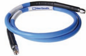
CASE STYLE: MA1628-3.28