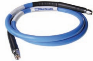
CASE STYLE: MA1628-1.5