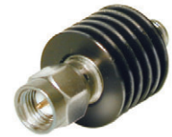
CASE STYLE: DC737