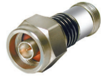
CASE STYLE: DC736