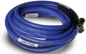
CASE STYLE: HW1388-15